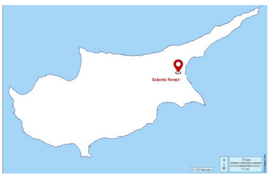
Figure 1: Study area: Salamis forest (Map showing the location of Famagusta, North Cyprus).

numbers TE007 and TE008) were deposited and retained in the herbarium at Eastern Mediterranean University, Faculty of Pharmacy. Information such as local names, areas of use, parts used, preparation methods, and usage dosages of these plants were recorded.