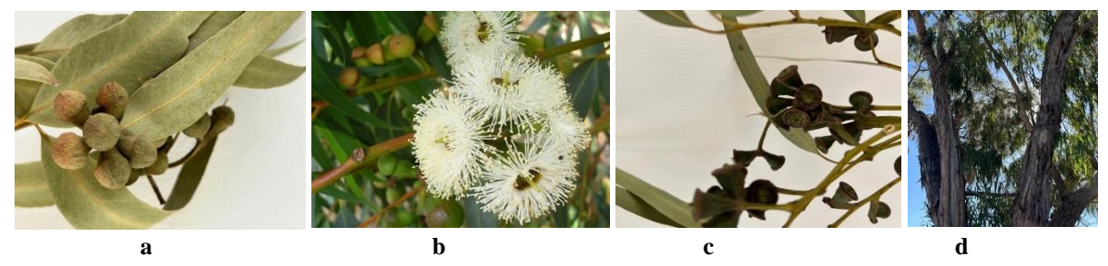
Figure 2. Flowers' buds (a), Flowers (b), fruits (c) and barks (d) of E. gomphocephala.

Flowers buds, Flowers, fruits, and barks of E. gomphocephala (Figure 2) and E. camaldulensis are shown in Figure 2 and Figure 3.