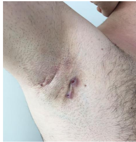
Figure 2. Fistula with two openings and atrophic scars on the right axillary area at 3 months

patient had clinical improvement in abscess lesions in month 3 (Figure 2) and in sinus tracts at the end of month 6 (Figure 3). In addition to this; according to HISCR clinical response was seen in 9 patients (75%) (Figure 4). All of the patients included in this study were called separately and suggested to answer the questions in the Dermatology Life Quality Index (DLQI) questionnaire. All of the patients responded to treatment orally defined that; there has been no newly development or if present; it has occurred as smaller than the previous ones and the lesions disappeared more quickly. Besides, they reported that the exudation has stopped, no abscess has developed as the priors and the bed smell have already decreased or disappeared. In 7 patients; a decrease from Hurley 3 to 2, and in remaining 2 of the 5 patients with Hurley 2; a decrease to Hurley 1 were recorded after adalimumab treatment (Table 1).