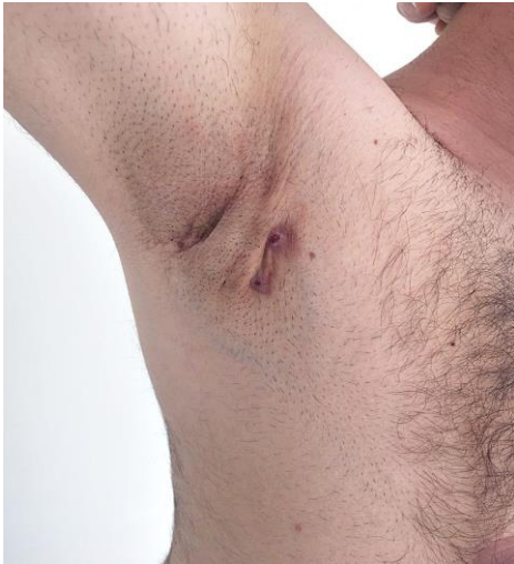
Figure 1. The subcutaneous abscess formation on the right axillary area accompanied with fistula with two openings and atrophic scar tissue before the adalimumab treatment

Before the treatment involvement of Hurley stage 3 were seen in 7 patients, and Hurley stage 2 were observed in remaining 5 patients (Table 1). In all patients at least one or more inflammatory nodules and involvement of 2 or more anatomic areas were observed. The presence of abscess, sinus tracts and atrophic or hypertrophic scars were detected. Axillary and inguinal regions; in 9 patients (75%), chest; in 3 patients (%25), perineal or perianal areas; in 1 patient (8%), submammary area; in 1 patient (8%) and penil area; in 1 patient (8%) were involved (Table 1). The clinical photograph of a patient having an involvement of Hurley stage 3, subcutaneous abscess formation in right axillary area, fistula with two openings and an atrophic scar areas given in Figure 1.