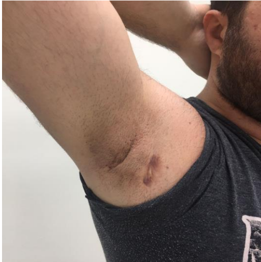
Figure 3. Atrophic scar areas on the right axillary area at 6 months

Before the treatment DLQI score was 14.4 \pm 6.9 (range 7-21), but after the treatment DLQI score was found as; 4.3 \pm 3.8 (range 1-8) ( p < 0.05 ). Besides, before the corticosteroid treatment dermatology life quality index (DLQI) was found as 13.7 \pm 5.3 (range 7-21), but it was 11.3 \pm 2.1 (range 5-12) after the treatment. Before the systemic antibiotic use, DLQI score was 13.2 \pm 3.3 (range 8-21), but after the treatment; it was 10.1 \pm 2.4 (range 3-12) and before the retinoid use DLQI was recorded as; 14.7 \pm 5.2 (range 8-17) and after treatment as; 9.4 \pm 2.3 (range 3-11) ( p > 0.05 ). We also ascertained that after the treatment a consultation was made to a nutritionist for all patients and started on either a lower fatty diet or a specialized diet accepted for patients with diabetes mellitus and metabolic syndrome.