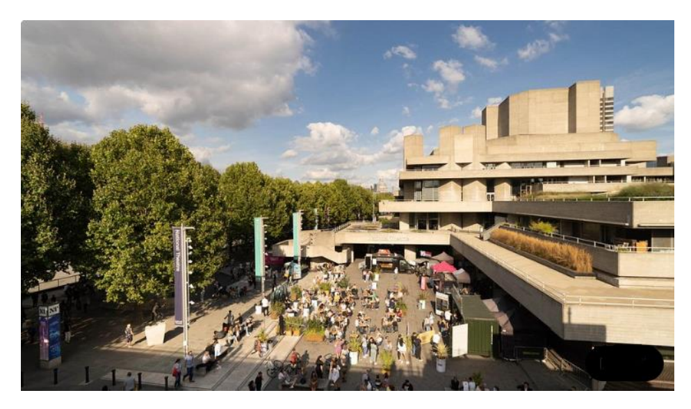
Figure 4. The Grand National Theatre in England, on the banks of the River Thames https://www.tripadvisor.co.uk/Attraction_Review-g186338-d188721-Reviews-South_Bank-London_England.html

creating diverse events in urban green spaces is an important factor in rejuvenating the health of communities and enhancing the human character of different age groups, during the day and days of the week (Petrow, 2008). Like a residence Talking toy for kids Sports fields, as for cultural use and cultural activities, various festivals are held, memorials are erected, and museums are built to attract the public, such as the Branly Museum. In Paris on the banks of the Seine, exhibitions, cultural gatherings and artistic performances are held in theatres such as the National Theatre on the south bank of the River Thames in England, as shown in the Figure 4.