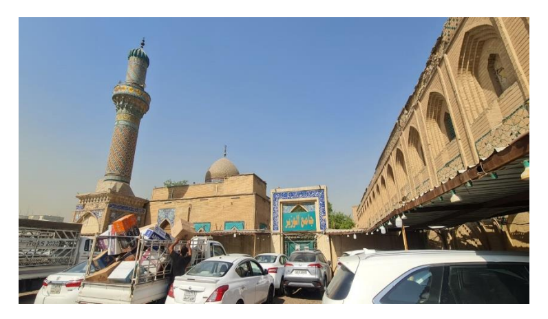
Figure 15. The riverfront adjacent to the minister's mosque is neglected

1. Suffering The riverfront adjacent to the Minister's Mosque is neglected, difficult to access, and has random traffic due to the presence of a parking lot that is not qualified in an urban manner, as in the figure. As for the riverfront adjacent to the Baghdad Cultural Center, the barracks, and the governor's house, it suffers from isolation and is not exploited as an attractive point. As shown in Figure 15.