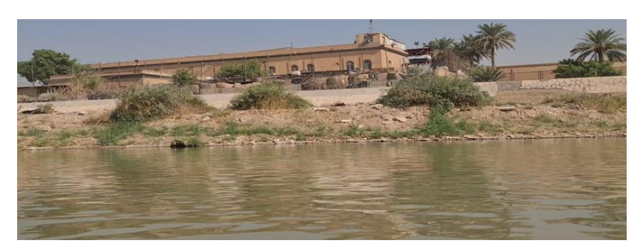
Figure 12. Neglect of the riverbank adjacent to the Ministry of Defense and the Abbasid Palace

1. Suffering The riverfront adjacent to the Ministry of Defense and the Abbasid Palace is isolated because it is a deserted area with many concrete castings and iron insulators. It also lacks the human scale of containment and a sense of security, difficulty of movement, and not being exploited in developing the area, as in the Figure 12.