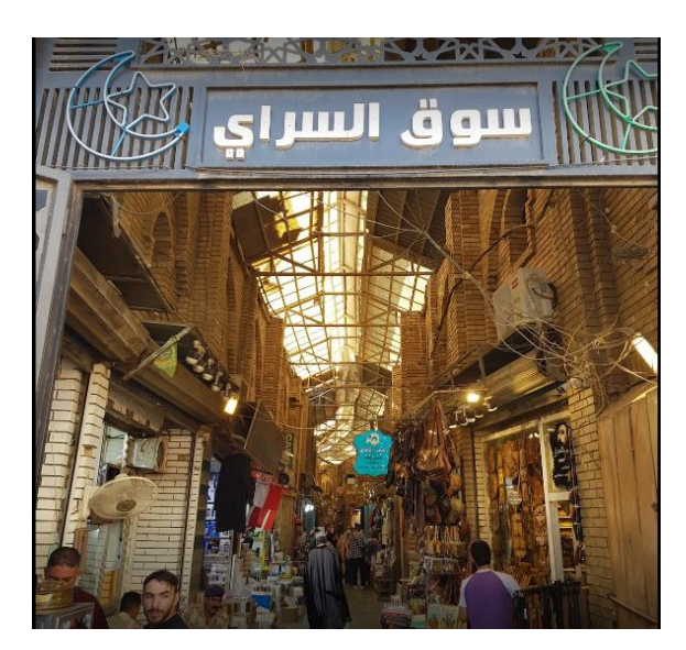
Figure 17. The Saray Souq