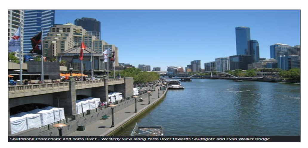
Figure 3. Yarra River City of Melbourne

And I followed Melbourne city On the bank of the Yara River Humanization Strategy by converting it to open green spaces and pedestrian bridges work Association On both banks of the river as in the Figure 3.