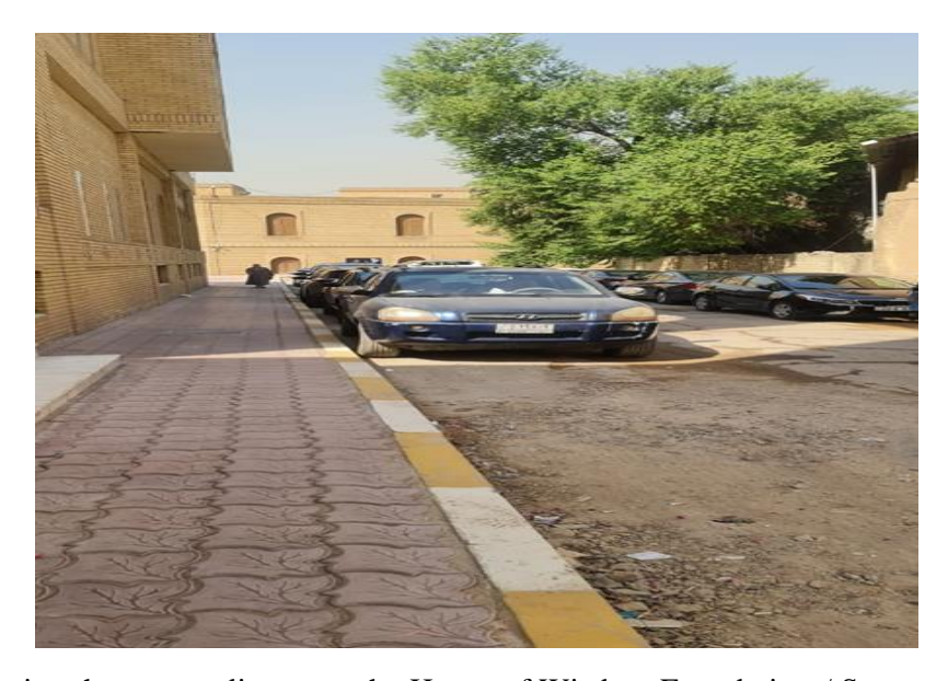
Figure 14. Neglecting the street adjacent to the House of Wisdom Foundation

3. The weak connection between the House of Wisdom and its library on the one hand and the Abbasid Palace on the other hand, as these streets lack signboards and suffer from clear neglect in terms of paving and street furniture, the lack of pedestrian traffic in them, and the absence of economic activities in them, in addition to the movement of cars in them, knowing that the width of the streets is (3-6) m. As in the Figure 14.