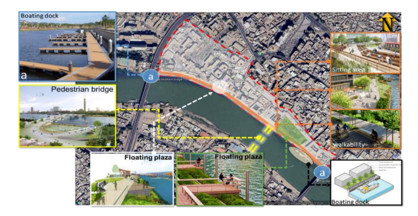
Figure 18. Proposed planning treatments