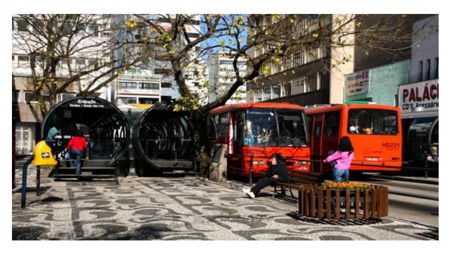
Figure 6. Public transport in Cortinha city

Public and River Transportation:- Efficient public transport enhances the human presence in the city as it: It will provide easy access to the riverside and all parts of the city and reduce private vehicles and parking. Dedicated to it. Thus, these spaces are available for social, cultural and economic activities. In the event that there is a parking lot, it should be in appropriate, planned places that preserve Balance on the riverbank: The city of Curitiba has adopted the principle of public transport for some time to give a human character and revive the central area and encourage pedestrian movement. Partially closing the city center to car traffic and operating a rapid transit system for buses and create special parking spaces for bicycles and specific paths (Al-Hinkawi & Al-Saadi, 2020) As in the Figure 6.