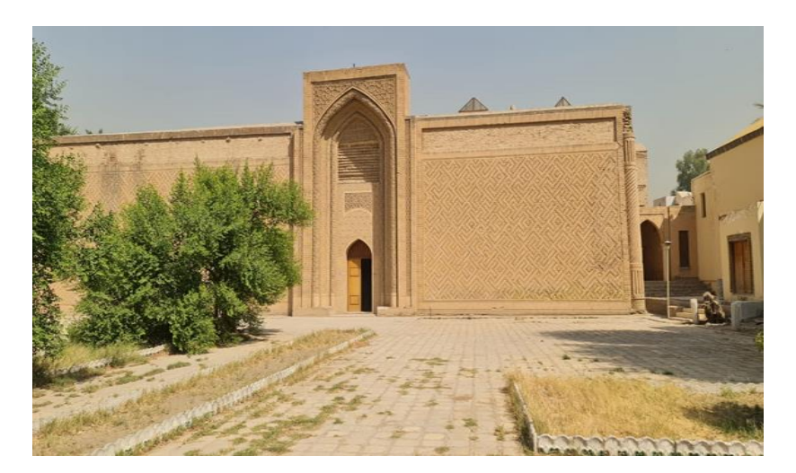
Figure 13. Neglect of the Abbasid Palace and its courtyards

2. The Abbasid Palace lacks interest and neglect and suffers in all its parts, as it needs architectural and engineering maintenance, as it is an important cultural monument that represents an important historical era, as in the Figure 13.