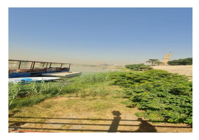
Figure 16. The riverfront in front of the mutanabbi statue & a river transport station