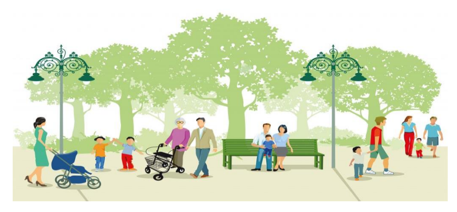
Figure 1. Humanizing urban spaces

One of the important goals of humanizing cities is to increase communication between people, strengthen ties between them, and create opportunities for cultural and social harmony. This is clearly evident in urban spaces, where the shift from silent negativity to positivity requires several important points (Hadi & Alwan, 2021) And it is a for connectivity, accessibility and mixed land uses. And the attraction and the vitality, And the human scale. As in the Figure 1.