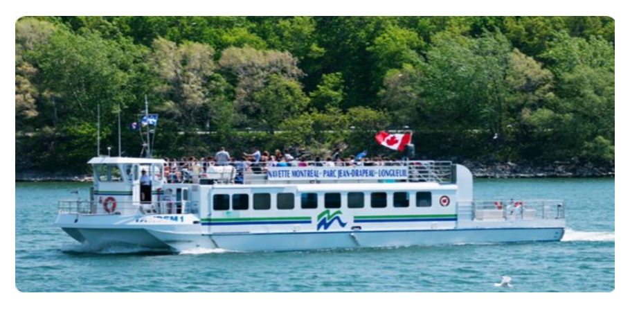
Figure 7. River transport in Montreal Canada

Developing river transport and enhancing its role is considered one of the important conditions for reviving the riverfront and achieving human presence in it. People are naturally attracted to the river and its banks, and to using its waters to move from the dams (Nefedov & Stiglitz, 2015) As in Montreal, Canada, river transport provides easy access to certain places and meets modern urban challenges. As in the Figure 7.