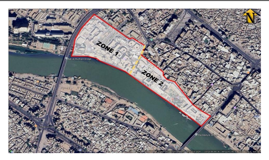
Figure 11. The study area

The research divided the study area into two main sections, in which it identified the current situation of the area, its weaknesses and strengths, as in Figure 11: