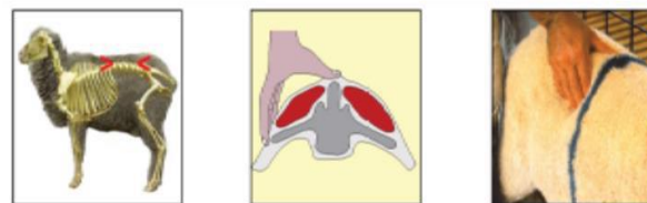
Figure 1. Determination zones of body condition score in sheep (Koyuncu et al. , 2018).

To determine the BCS of the mating ewes, a scale ranging from 1 to 5 with 0.5 intervals was used, as recommended by Sari et al. (2013) and Koyuncu et al. (2018) (Figure 1). When recording the BCS values of the ewes postpartum, two assessors scored simultaneously. In cases where there was a discrepancy in the independently assigned BCS values, scoring continued until a consensus was reached between the assessors.