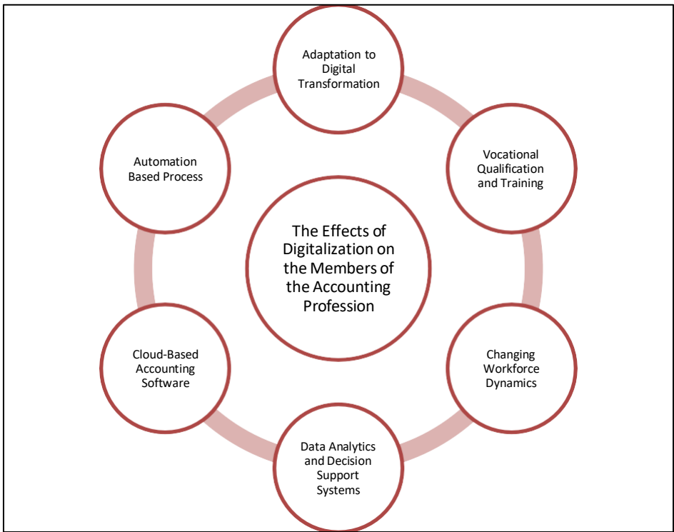
Figure 3: The Effects of Digitalization on The Members of The Accounting Profession

There are developments in many sectors with the impact of digitalization. Accounting is one of these sectors. Digitalization, which contributes to increasing efficiency and reducing costs incurred by enterprises, It is also the beginning of an important change for the accounting profession. With digitalization, the old order accounting process has undergone a change. In the new order, financial transactions realized on paper have been replaced by digital financial transactions and time and space benefits have been provided for members of the accounting profession. The effects of digitalization on the members of the accounting profession is explained in Figure 3.