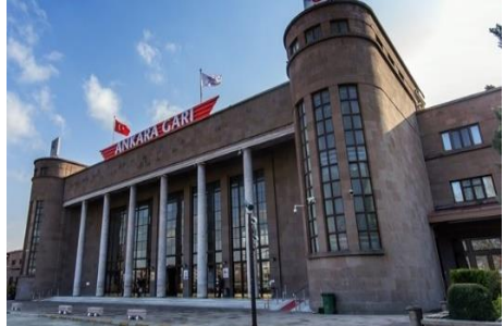
Figure 4-5. Head Office Building (URL-2); Historical Station Building (personal archive).