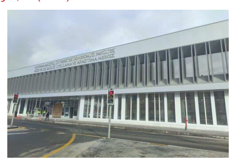
Figure 6. Medipol University Dentistry Building (personal archive).