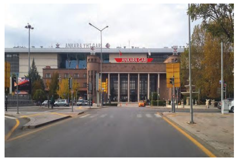
Figure 2-3. High Speed Train Station (URL-1); Silhouette of Ankara Station (Tektaş & Akalın, 2020: 72).