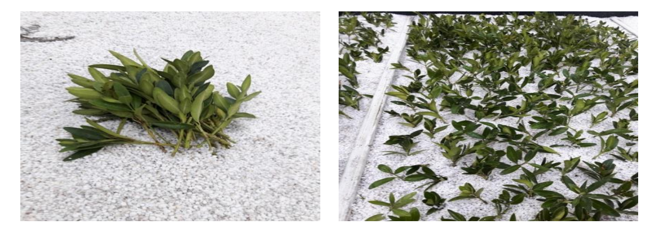
Figure 2. Rooting medium and appearance of rooted cuttings.

from one-year-old upright branches located on the upper part of the plant. To prevent drying during transportation from the collection area to the production unit, 10-15 cm-long shoots were cut, moistened and placed in plastic bags. The cuttings brought to the institute were kept in cold storage for one day and then taken into the planting process.