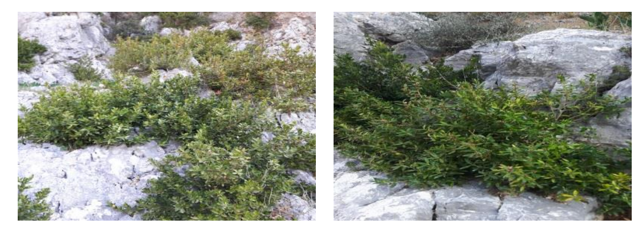
Figure 1. B. balearica location view.