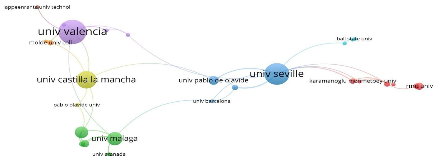
Figure 1. Strong Inter-Institutional Collaboration Network

When Figure 1, which presents the strong collaboration networks of the institutions, is examined, 13 institutions have been reached. It is seen that these 13 institutions, with strong collaboration between them, are shown in 7 different color clusters. Among the 7 different colored clusters, three different colored clusters stand out. It is seen that the highest collaboration is between the red clusters "Karamanoğlu Mehmet Bey University"