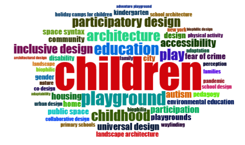
Figure 1 Word Cloud for Children (Reference: Burkut, 2025)

The scientific mapping findings from this study were created using R Studio, Bibliometrix, and Biblioshiny. According to the analysis of the research data for word occurrences in Figure 1: children (42), environment (24), physical activity (19), design (18), health (13), play (13), architecture (11), impact (11), behavior (10), perceptions (10), space (10), performance (9), city (8), home (8), place (8), quality (7), affordances (6), buildings (6), care (6), features (6), neighborhood (6), stress (6), associations (5), environments (5), preferences (5) (Figure 1). Figure 2 also displays the results of the science mapping network study. Figure 1 depicts a word cloud for children, while Figure 2 illustrates the science mapping of the network. Figure 3 shows the trend of the subject in the children's research graph.