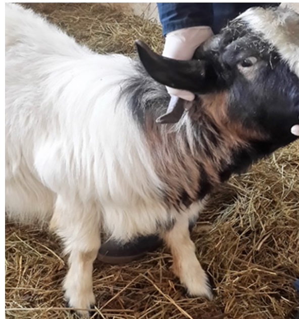
Figure 2: Image of the lump detected in the right submandibular and prescapular lymph nodeles by clinical examination.

Leukocytosis and neutrophilia were detected by hematological examination and it was determined that the erythrocyte and thrombocyte index were normal.