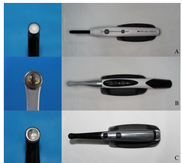
Figure 1. Fiber guided Deepcure-L(A) and polywave O-Light(B) ve Valo(C)

After years of using halogen, plasma arc, and argon laser light devices, the second generation of LCUs with an emittance range of 500-1500 mW/cm 2 was introduced in 2002 (11,12). In 2004, high-performance LCUs reaching 5000 mW/cm 2 were developed utilizing LED technology (13,14). Although LED technology, which is a cold light source, can provide the necessary emittance and a wavelength of 400-500 nm (nanometers) for polymerization without reaching elevated levels, studies have indicated that temperature increases may cause irreversible damage to the pulp. LED units utilize light guides, either a fiber pipe or a diffuser lens. Fiber pipes, known as fiber guides, are typically found in single-peak (monowave) LCUs that contain a single LED. Diffuser lenses are used in the newer multiple-peak (polywave) units, which feature multiple LEDs to encompass all wavelengths needed for resin polymerization. The LCUs included in the study are the O-Light (DTE Guilin, China) at 1000-1200 mW/cm 2 with 420nm-490nm wavelength spectrum, the Deepcure-L (3 M ESPE, USA) at 1470 mW/cm 2 with 430-480 nm wavelength spectrum, and the Valo (Ultradent, USA) at 980 mW/cm 2 with 385–515 nm wavelength spectrum. Among these LCUs, the Deepcure-L represents single-peak fiber-guided LED models, while the O-Light and Valo are multi-peak LED devices emitting through a lens (Figure 1).