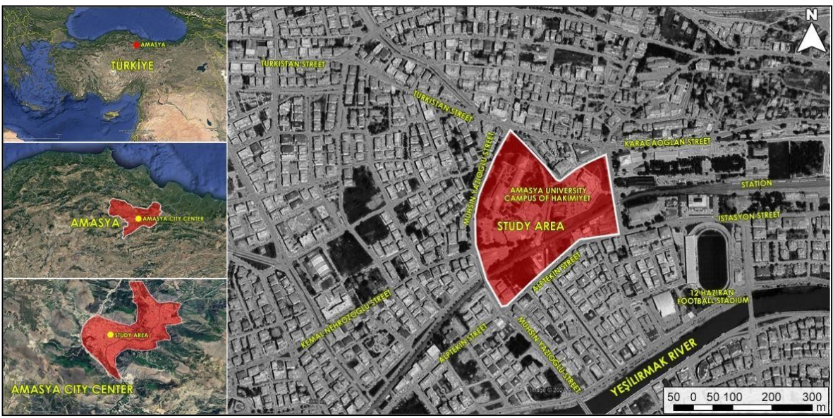
Figure 1. The study area.

The Hâkimiyet Campus of Amasya University, located within Amasya Province's central district in Türkiye, was selected as the focus of this study. The campus is specifically located on Muhsin Yazıcıoğlu Street. The campus consists of the A-B-C blocks of the Faculty of Education, a conference hall, the central library building, the rectorate building and sports grounds (Figure 1). It is located 2.5 km from the center of Amasya. The campus is within walking distance of the city center, and it takes approximately 7 minutes by car to reach the city center via Muhsin Yazıcıoğlu Street.