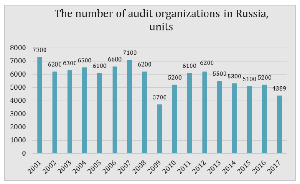
Fig.2. The number of audit organizations in Russia, units

Th changes that took place after the adoption of the second Law "On Auditing" in 2008 year (hereinafter - 307-FZ) sharply reduced the guaranteed volume of compulsory audit, which led to a reduction in the number of AF (Fig. 2) and the emergence of a characteristic feature of the Russian audit - dumping prices.