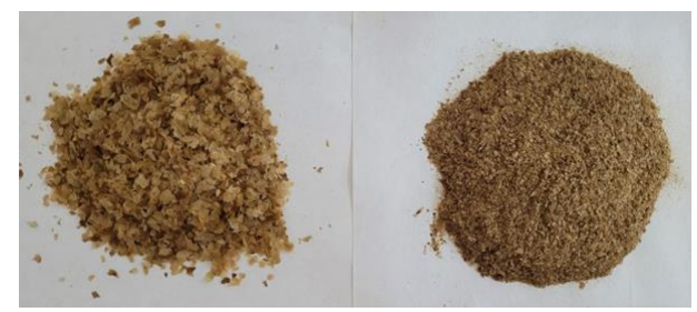
Figure 1. Non-sieved and sieved CSS samples.

pretreatments. CSS pretreatment was carried out in 200 mL Duran bottles, and sieved CSS sample was mixed in acid and alkaline solutions and then autoclaved (HiClave HV-25 autoclave, HMC, Japan) at 121 °C. After removal from the autoclave, the liquid portions of the samples were filtered through a coarse filter paper, separated for glucose determination, and filtered through a syringe filter with a porosity of 0.45 \mu m before analysis.