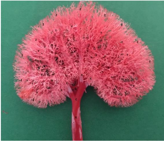
Figure 4: Ventral view of the right renal artery.

R-right renal artery, B-right dorsal branch, C-right ventral branch, X-interlobar artery, Y-arcuate artery, Z- interlobular artery.