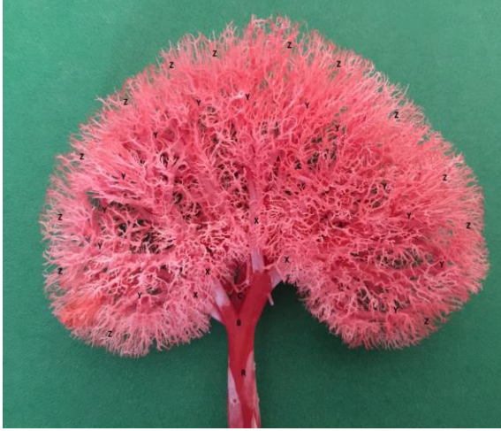
Figure 3: Dorsal view of the right renal artery.

9.97 mm and the average diameter of arteria renalis sinistra 9.67 mm (Figure 3-4).