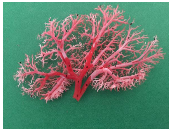
Figure 6: Ventral view of the left renal artery.

L-left renal artery, E-left dorsal branch, F-left ventral branch, X-interlobar artery, Y-arcuate artery, Z- interlobular artery.