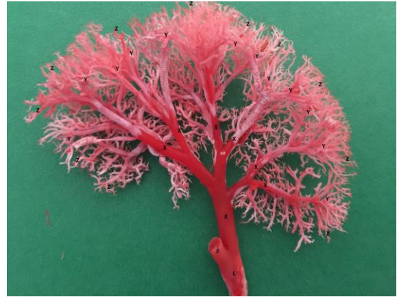
Figure 5: Dorsal view of the left renal artery.

The right ventral branch was about 8.31 to 9.72 mm in diameter and 14.57 to 15.01 mm in length and ramified as three–four right arteriae interlobares (Figure 5). The left ventral branch was about 8.79 to 8.82 mm in diameter and 13.05 to 13.6 mm length and ramified as four–five left arteriae interlobares (Figure 6). In the left kidneys, half of the material had a third branch (intermediary branch) emerged from the junction of the dorsal and ventral branches. This branch was separated 2-4 pieces aa. interlobares (Figure 7-8).