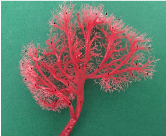
Figure 8: Ventral view of the left renal artery.

L-left renal artery, E-left dorsal branch, F-left ventral branch, D-left intermediary branch, X-interlobar artery, Y-arcuate artery, Z- interlobular artery.