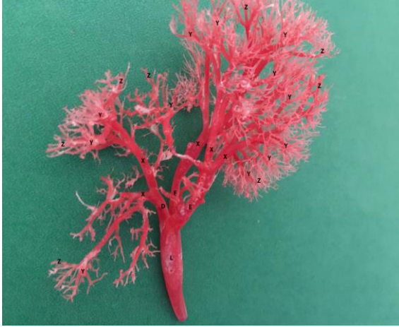
Figure 7: Dorsal view of the left intermediary renal artery.

Şekil 7: Sol intermedier renal arterin dorsal'den görünümü.