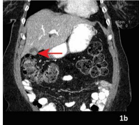
Figure 1b. The coronal view of an abdominal computed tomography of the patient showing localized type adenomyomatosis of gallbladder settled in fundus (red arrow).

D. bil: 0,1 mg/dL, ALP: 84 U/L, CEA: 0,75 ng/mL, CA 19-9: 17,15 U/mL, GGT: 9 IU/. Ultrasonography findings revealed that a 18x17 mm hypoechoic lesion existed on the gallbladder wall involving calcification and cystic spaces and was evaluated in support of focal adenomyomatosis. A mass lesion with soft tissue density reaching approximately 16 mm in diameter was found in the gallbladder at the fundus portion on CT results of the patient and this lesion was thought to be in compatible with gallbladder adenomyomatosis (figure 1,2). In the history of the patient, she was diagnosed with sigmoid volvulus and sigmoid colon resection was applied on her.