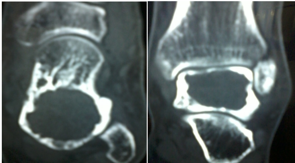
Resim 3. Axial CT view