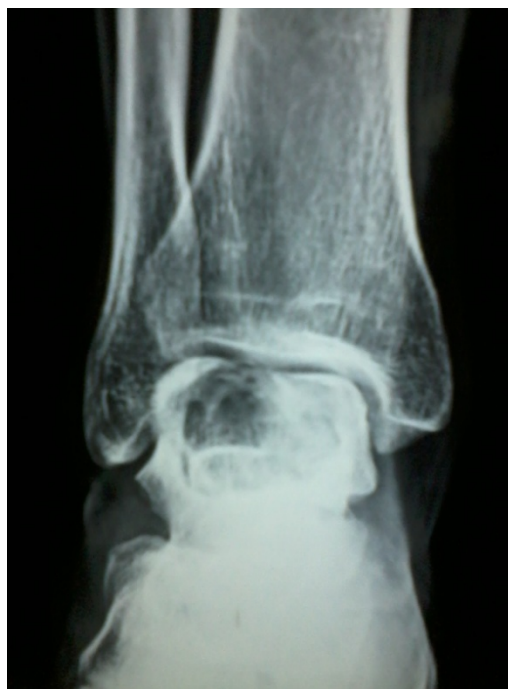
Resim 1. X-ray anteroposterior lateral view

Histopathology revealed many vascular canals filled with blood and fibrous bands containing stromal cells of giant cell type seen. Some osteoid were also noted (Figure10). The findings were suggestive of Aneurysmal bone cyst.