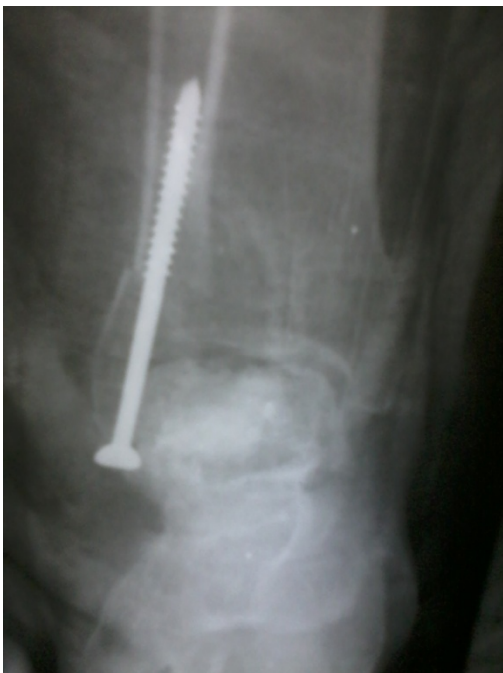
Resim 7. Follow up at 1 year