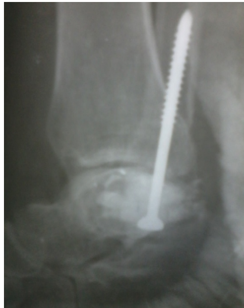
Resim 6. Immediate post operative photo.