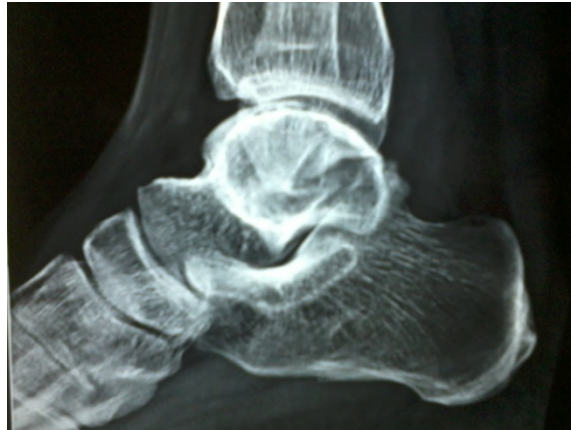
Resim 2. X-ray lateral view