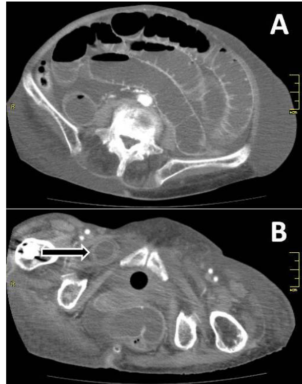
Figure 1. Abdominal tomography with contrast showed dilatation of intestinal loops with air-fluid levels, which were consistent with the diagnosis of ileus (A); the view of the small intestinal region that was incarcerated into the right obturator canal (B) (black arrow).

Conflict of interest and source of funding statement: The authors declare that they have no competing interests and no funding statement.