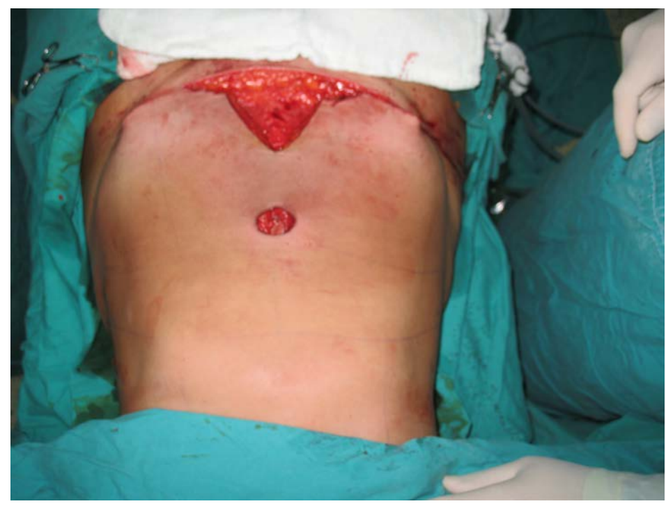
Figure 1. Skin flaps extend up to xiphoid.