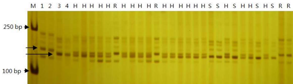
Figure 1. Polymorphic DNA fragments detected by SSR marker Xwmc441 in N0324 × Shaanyou 225 F 2 population M: 2 kb DNA ladder; 1: N0324; 2: Resistant bulk; 3: Shaanyou 225; 4: Susceptible bulk. H, R and S stand for heterozygous susceptible, homozygous resistant and homozygous susceptible plants, respectively.

F 2 plants along with the two parents (N0324 and Shaanyou 225) were sown in the experimental field of College of Agronomy, Northwest A&F University (Shaanxi, China), where the local race of Blumeria graminis f. sp. tritici ( Bgt ) named ‘Guanzhong 4’ occurs frequently. Around the field, the spreader variety, Chancellor (Suppl. Figure 1), which is often used in the laboratory to maintain some Bgt isolates (Xue et al., 2012), was also planted to facilitate the disease propagation. The objective was to evaluate these lines for their resistance gene reaction to powdery mildew by natural infection. The test results were scored at adult plant stage when pustules of powdery mildew were fully developed on the spreader variety (Chancellor), the susceptible parent Shaanyou 225 and some susceptible F 2 plants. Infection types (IT) of the parental lines and the segregating F 2 population were scored on a scale of zero to four (Sheng, 1988) and powdery mildew resistance reactions were classified into two groups, resistant and susceptible. Plants with IT value 0, 1 and 2 were distinguished as resistant whereas those with IT value 3 and 4 were susceptible.