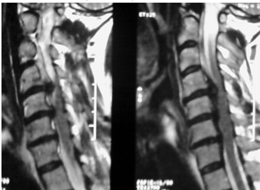
Figure 1. Sagittal T2-weighted MR image revealed a hypo intense signal posterior to vertebral body margin and disc herniations at C4-5 and C5-6 levels

Electromyographic test, performed 3 weeks after discharge, revealed a delay in distal latency of left CPN and denervation potentials of tibialis anterior and peroneus longus muscles were recorded. The test confirmed a CPN injury at fibular head. The EMG at 3 months check showed similar results. After continuous physical therapies and exercises during 6 months, dorsiflexion of the left foot was improved to 3/5 strength. Her motor strength recovered totally 1 year after the operation except the sensation loss of the foot dorsum.