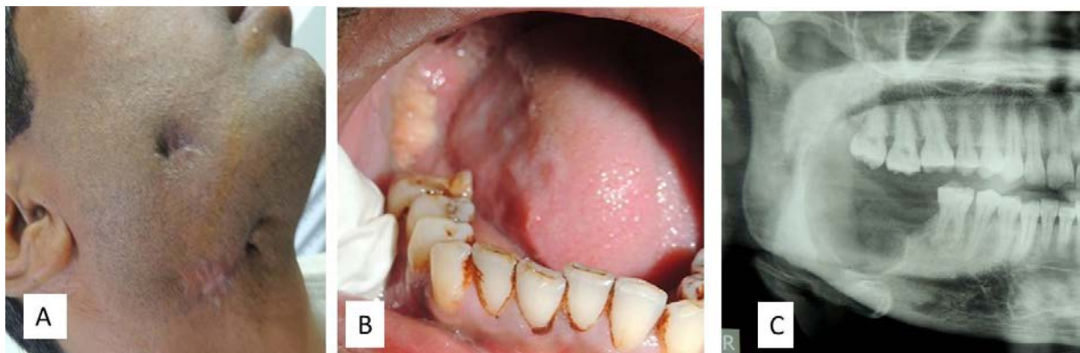
Figure 3. A- Post-operative extra oral picture showing healing of sinus opening. B- Post - operative intra oral picture. C- Post- operative radiograph showing complete removal of the radio opaque mass.