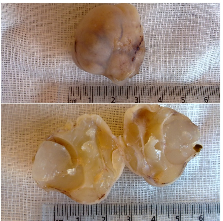
Figure 1. The hysteroscopic view of the cystic lesion.

The cyst was reported as NC after the macroscopic and histopathological observations (figure 2). In the one-year- follow up of the patient, there was no complaint observed.