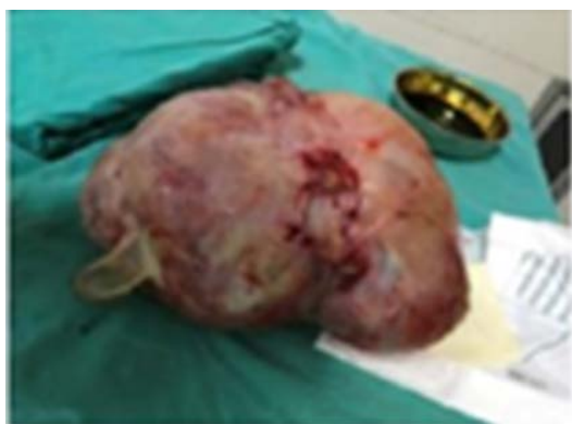
Figure 2. Intraoperative view of the adnexal mass.

No palpable lymph node or metastatic tissues were observed. On the macroscopic examination, right ovary was normal. Right tubal uterine and uterus was clearly visible, but left tubal uterine was indistinguishable. The tumor was not invasive in the surrounding tissues including omentum. It was limited in the ovarian capsule. Stage was evaluated as IA according to FIGO. Minimal adhesion was observed in the surrounding tissues. The adhesions were surgically dissected (Figure 2).