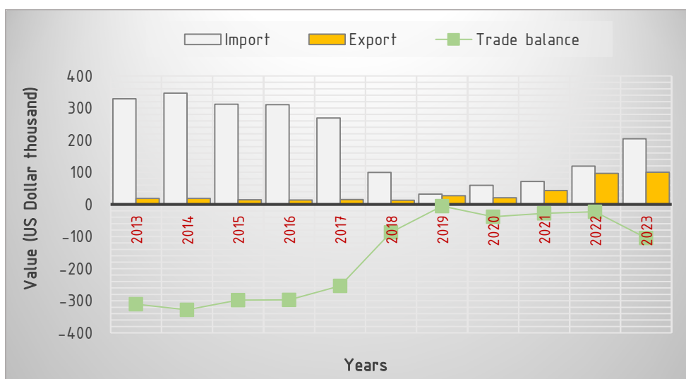
Figure 1. Türkiye's plywood, veneered panel and similar laminated wood export, import and trade balance.

Figure 1 shows Türkiye's plywood, veneered panel and similar laminated wood export, import and trade balance, while Figure 2 demonstrates the plywood, veneered panel and similar laminated wood export, import and trade balance of other OECD (Organisation for Economic Co-operation and Development) countries. The data used to create Figure 1 and 2 were obtained from the Trademap website (URL-1).