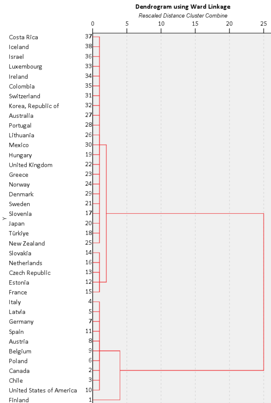
Figure 3. Dendrogram of export data.