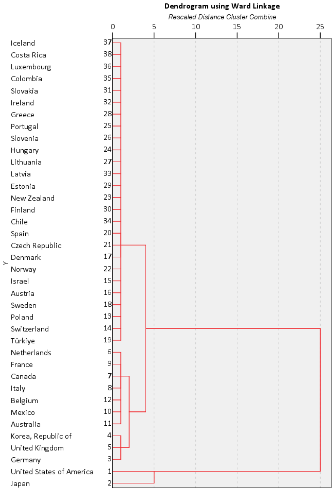
Figure 5. Dendrogram of import data.