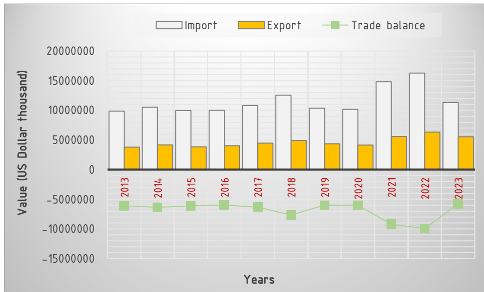
Figure 2. Export, import and trade balance in terms of plywood, veneered panel and similar laminated wood of OECD excluding Türkiye.

Considering the years 2013-2023, it is possible to draw a general conclusion from Figures 1 and 2 that the plywood, veneered panel and similar laminated wood import values of both Türkiye and other OECD countries are higher compared to their export values. It is seen that the trade balances are obtained in negative. On the other hand, as seen in Figure 1, the difference between import and export values in 2018 and the following years (until 2023) is significantly lower than the difference in the years before 2018 (2013-2017).