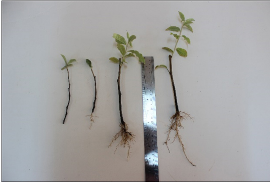
Figure 3. Rooting situation in NAA 5000 ppm treatment

Şekil 3. NAA 5000 ppm işlemindeki köklenme durumu