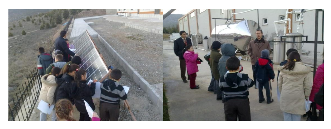
Figure 2. Examining of clean energy house and biogas plant by students at S.D.U. (Tortop, 2012a)

12 Meaningful field trip in education of the renewable energy technologies