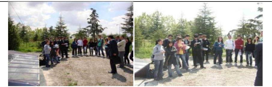
First Stage (Engagement): The teacher asks the students questions about SCA such as what it is and how SCA works. So, The students will be curious about SCA.

Table 2. Teaching the Solar Chimney Applications (SCA) according to 5E Learning Cycle Model (MFT)Tortop (2010)