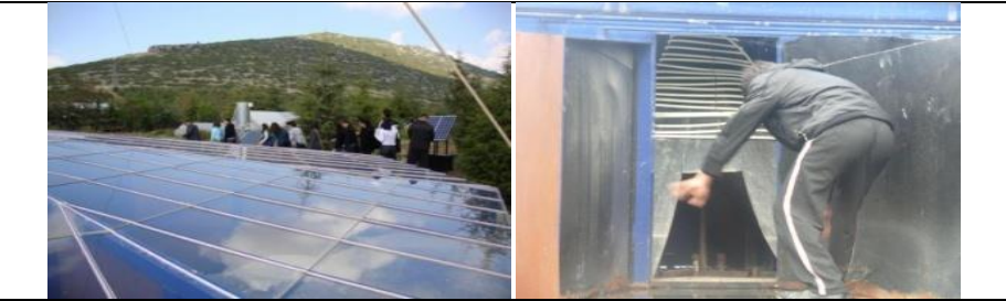
Journal for the Education of the Young Scientist & Giftedness, 2013, 1/1