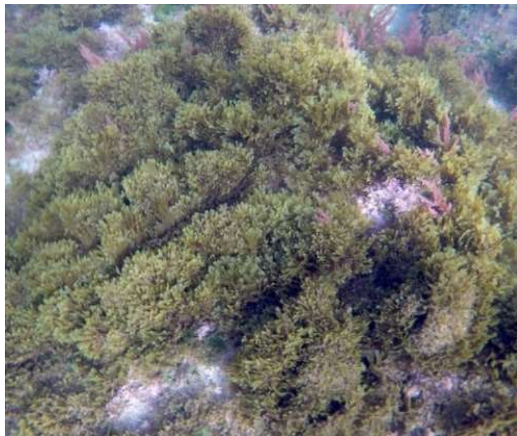
Figure.2. Rugulopteryx okamurae . In situ habitat of a population from Belyounech Beach.

Material was sectioned manually with a Scalpel. The sample was studied under the light microscope, and the photos were made using a camera linked with a software Leica Application Suite (LAS, version 5.4.0).