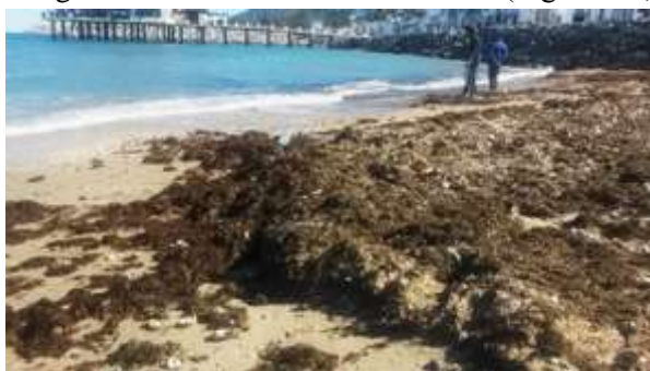
Figure.4. Stranding of Rugulopteryx okamurae in M'diq beach.

In February 2018, a remarkable stranding of R. okamurae was observed in M'diq beach, 35° 40'59" N and 5°19'8" W (Figure 1B and Figure 4) and in March 2018 some specimens fixed on the rocky in intertidal area were observed near the harbour of Tanger, 35°47'25" N and 5°48'50" W (Figure 1D).