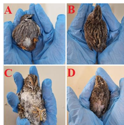
Figure 1. Wild feather color of male and female blue-breasted quails (A and B: top and bottom views of male; C and D: top and bottom views of female)

As shown in Figure 1, the wild-type plumage of the male, from which the species takes one of its names, is quite striking and has a slate blue-grey breast, a dark rust to chestnut-red abdomen with a slate blue-grey throat marking bordered by a black and white throat marking bordered by a black stripe called a badge (Uller et al. , 2005), while the wild female has dulled and rusty brown plumage. The whole pattern is in an anti-predatory plumage structure designed to be least noticeable when viewed from above and is surprisingly effective at concealing the bird. Black beak, yellow to orange leg and short dark brown tail are common to both males and females (Harrison, 1965). Nevertheless, the colour of the leg and toe are rubbery yellow in egg-laying females and more orange in males.