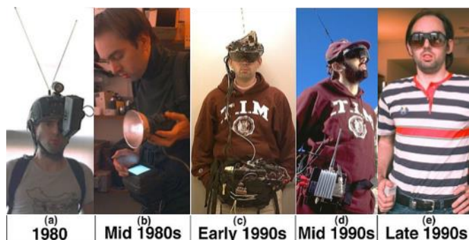
Figure 1. Mann's wearable system integrated into a backpack.

Studies in the field of wearable technology continued in the 1980s. In 1981, Steve Mann designed a 6502-based wearable system that includes text, multimedia, graphic and video functions mounted on a backpack [16, 17]. The changes in this system over the years are demonstrated in Figure 1 [16].