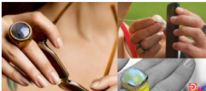
Figure 4. Smart Jewels.

etc. are produced with smart devices to record the daily activities of those wearing them. They are capable of long-term data tracking by establishing wireless connections with smart devices like mobile phones, and computers. Smart jewelry like rings, wristbands, eyeglasses, and belts are connected both among each other and to computers over the internet or via bluetooth [30]. Smart jewelry examples are demonstrated in Figure 4 [31].