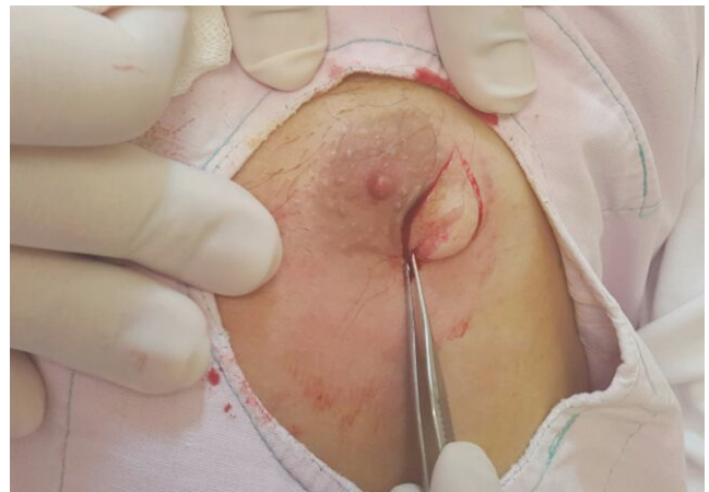
Figure 1. Excision of the subcutaneous nodular lesion adjacent to the left nipple

On cut surface, dermal, mucinous appearance was determined. Histopathological examination revealed poorly circumscribed, partially lobulated dermal myxoid collection (Figure 2a). The lesion was hypocellular and consisted of few spindle cells, vascular structures and fibrous septae. No mitosis was observed. In between myxoid stroma, sparse breast ducts and muscles were present (Figure 2b–d). The mucin stained positively with Alcian blue stain at pH 2.5 (Figure 2e). Immunohistologically, the lesion was negative for pancytokeratin and S100, but sparsely positive for smooth muscle actin (SMA) and relatively diffuse for CD34 (Figure 2f). A diagnosis of NM of the breast was made upon clinicopathological findings.