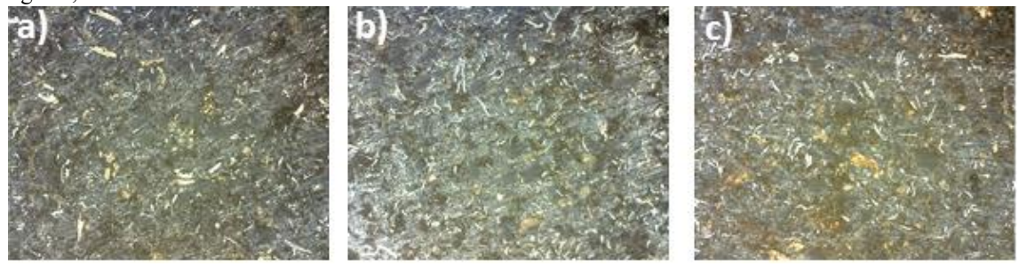
Figure 7. Microstructure of hazelnut dust brake pads: (a) B-W, (b) B-C-W, (c) B-CYC-W

No porosity or obvious defects were observed in any of the samples. However, more coarse hazelnut dust can be seen these pictures.