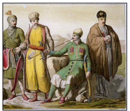
Circassian consumes tobacco in eighteenth century (Ferrario 81).