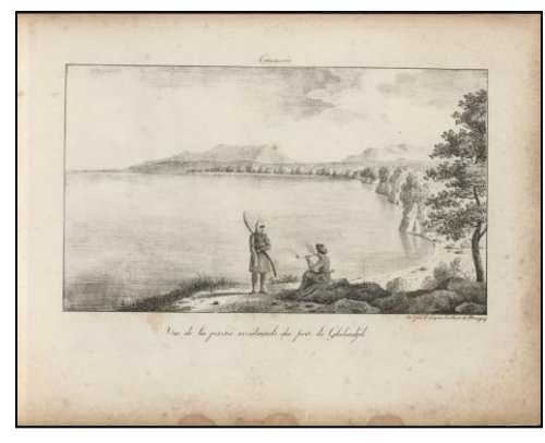
The view of the Western part of the Ghelendjik Port (Marigny Voyage ).