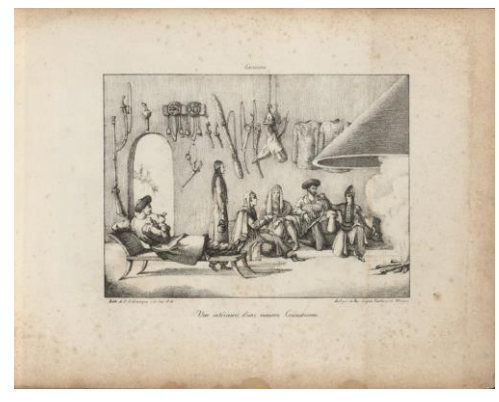
Inside view of a Circassian house (Marigny Voyage).