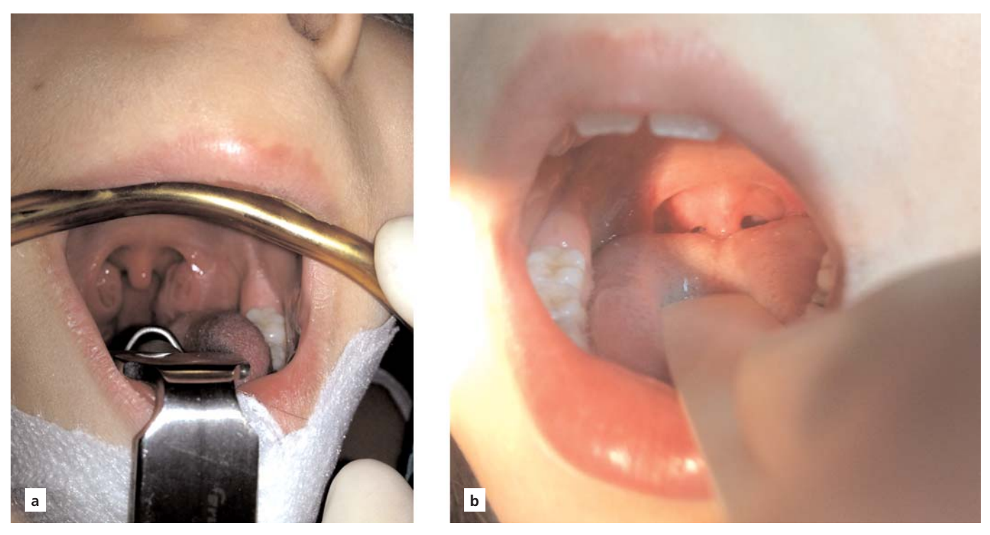
Fig. 2. (a) Preoperative and (b) postoperative 6-month appearances of the tonsils in a different patient. [Color figure can be viewed in the online issue, which is available at www.entupdates.org]

also with reduced need for postoperative analgesia, lower rates of postoperative bleeding and reduced number of postoperative infections.<sup>[7,8]</sup> Leaving a coating layer of semiviable tonsillar tissue has been shown to reduce exposure of the veins and nerves in the tonsillar plexus and superior constrictor muscle.<sup>[3]</sup> Additionally, significance of the remaining tonsillar tissue within the lymphoid system, rather than total excision has attracted an increased attention to tonsillotomy techniques.