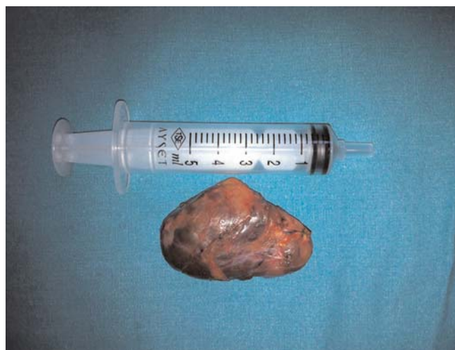
Fig. 1. Macroscopic view of the mass.

In the post-operative follow-up, a secondary neck mass formation was noticed on the contralateral (left) parotid gland five months later. USG imaging revealed a deep lobe mass with a size of 25×10 mm. The subsequent fine needle