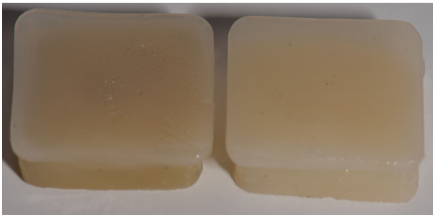
Figure 1. Resin cements were carried out onto dark and light background according to the manufacturer's instructions

According to a pilot study, for a power analysis with a 0.05 level and 80% power the required minimum sample size was n=40 . Statistical analysis was performed using SPSS 19.0 for Windows software (SPSS Inc., Chicago, IL, USA). The Shapiro-Wilk test was used to determine normality, and the test results showed that the data were not distributed normally therefore Kruskal-Wallis was performed. The Mann-Whitney U test was performed to determine whether color differences were significantly different between each group. The significance level was set at p<0.05 ( p<0.05 ).