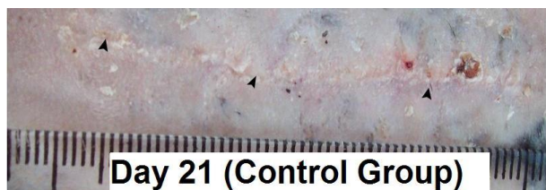
Figure 2. The view of the wound in control group at the 21 postoperative day (arrows: scar line)

Macroscopic findings: It was determined that OCA application was easier and had shorter application time compared to suturing. It was observed that must needs to close a wound with OCA ( 2.47 \pm 0.83 sec) is statistically shorter than suture ( 3.76 \pm 0.97 sec) ( p < 0.001 ). It was determined that the adhesive covers the incision line as a thin film layer and hold the wound edges together. The sutures in the control group were taken out at the 7 th postoperative day. Two rabbits died in 4-6 hours after the operation probably because of the anesthesia. The five sutured and OCA applied wounds ( n=5 ) were evaluated on postoperative days 14 and 21. Partial blood clot was observed on the wound edges in control group on the 3 rd postoperative day. Furthermore, slight inflammatory reactions were determined around the suture, while no inflammatory reactions were observed in the wounds closed with OCA wound edges. On the 7 th postoperative day, necrotic wound remains were observed on the incision line in the control group. Epithelization was seen in the regions without crust. In the OCA applied wounds, it was observed that the epithelization was better than the suture applied wounds. Besides it was also observed in some cases that there were some wound crust formations on some points through the incision line.