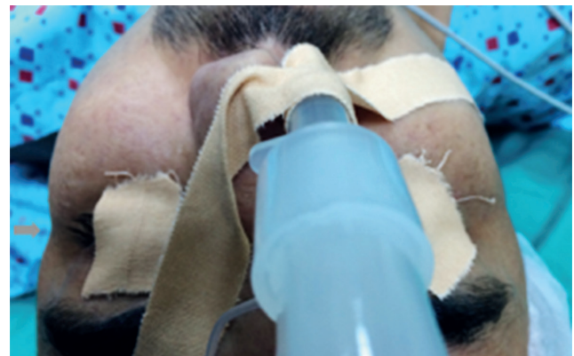
Figure 2. Pre-operative extra-oral image of the patient. Collapse is observed in the left zygomatic arch region