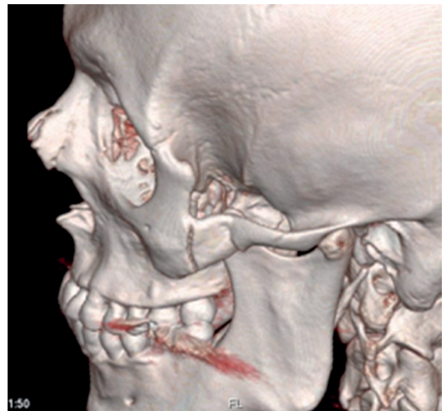
Figure 1. Pre-operative 3-dimensional computed tomography image of the patient; isolated zygomatic arch fracture is visualized

a 2 cm skin incision was performed and advanced until the temporal fascia dissecting the subcutaneous tissues. The superficial fascia of the temporal muscle was incised. The zygomatic arch was accessed by advancing downwards through the temporal muscle and fascia with the help of an elevator. Reduction was performed for the fractured part. The reduction of the fractured bones and the symmetry of both arches were checked over the zygomatic arch by palpation during the operation (Figure 3). The cutaneous and subcutaneous tissues were primarily sutured and the operation was terminated. Post-operative computed tomography examination revealed the continuity of