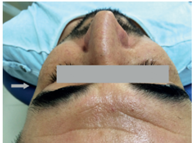
Figure 6. Post-operative extra-oral image of the patient (6 th month)

the zygomatic arch (Figure 4). The mouth opening of the patient was measured as 27 mm in the early post-operative period, and 38 mm at the 6 th month. No difficulty or pain was observed during mouth opening. No pain, sensitivity of asymmetry compared to the opposite arch was observed in the zygomatic arch region of the patient was observed in the extra-oral examination of the patient (Figure 5, 6). The patient's clinical 12-month follow-up was uneventful.