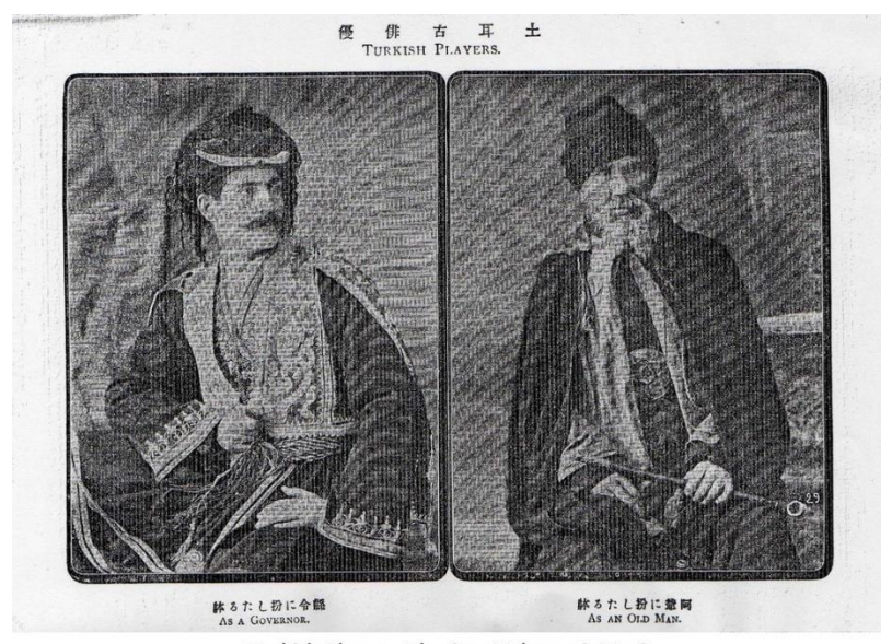
Turkish Players, The Sun, Volume 2, No.3