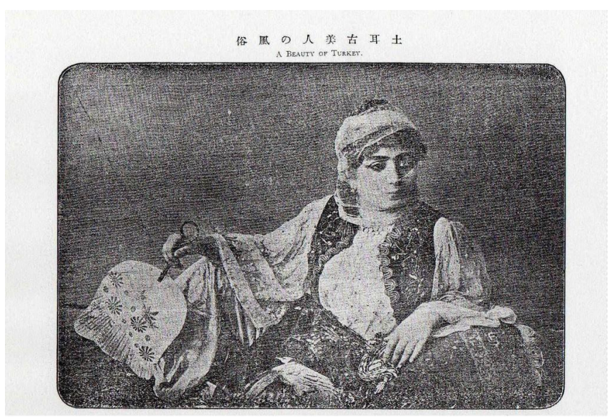
The Sun, Volume 6, No.14

The photo below (Vol. 6, No. 14) is an example that shows the exotic image of the harem dweller, a woman who is lazy, beautiful and passionate, which was very famous in Europe during the nineteenth century.