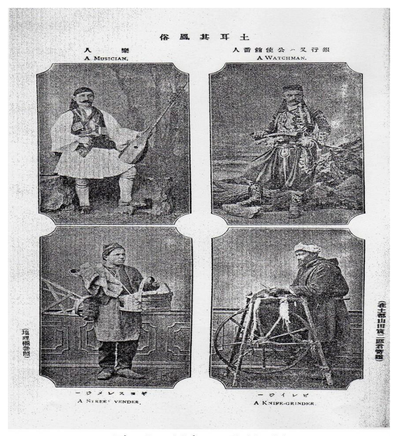
The Sun, Volume 3, No.11