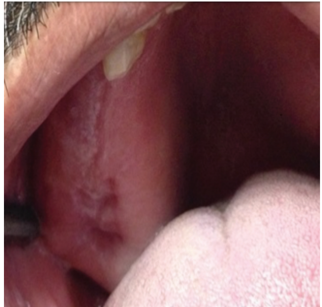
Figure 1. Intraoral photographs, swelling at the right maxillary posterior region of the patient

A 50-yr-old Caucasian man patient was referred to oral and dentomaxillofacial radiology clinic with a chief complaint of unilateral painless swelling of the right maxillary posterior region. It was learned that tooth extraction done years ago because of dental caries. He stated that swelling had occurred in the same area 8 or 10 years ago and had been removed by surgical approach. His medical history was unremarkable, and the neurological examination was normal. In clinical examination, swelling was observed at the right maxillary posterior region and lesion caused painless palatine-vestibule expansion (Figure 1). The overlying mucosa was in normal appearance. In panoramic radiographic examination, partially edentulous maxilla