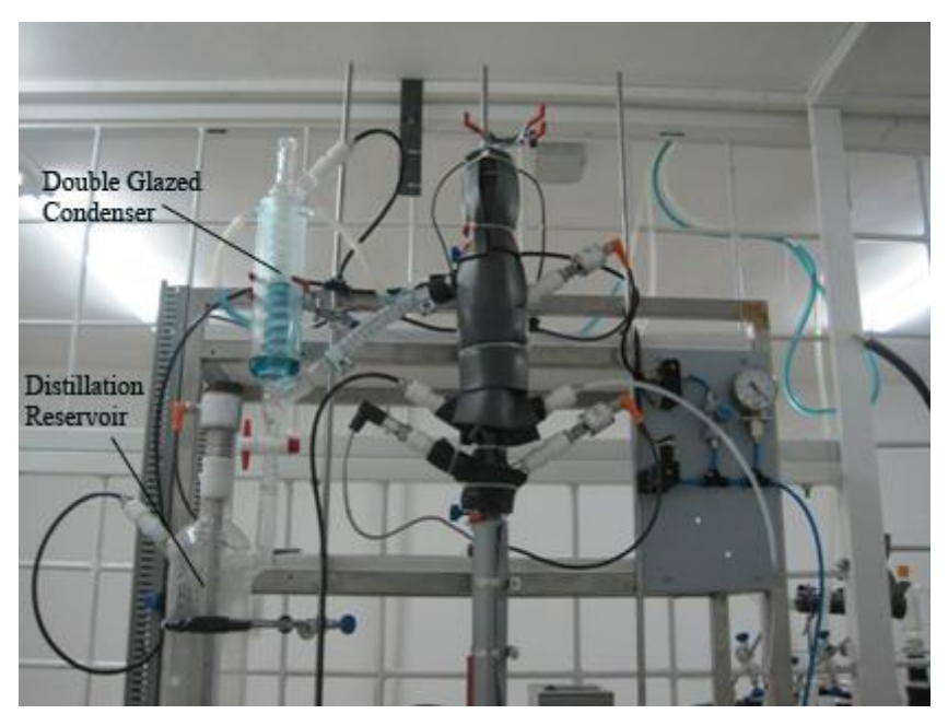
Figure 3. Double glazed condenser and distillation reservoir.

The water vapor passing rising and through the column in upward direction produced in boiler was condensed with the help of double glazed condenser cooled at 3-7 <sup>0</sup>C by a closed cycle chiller, and transferred to distillation reservoir (Figure 3).