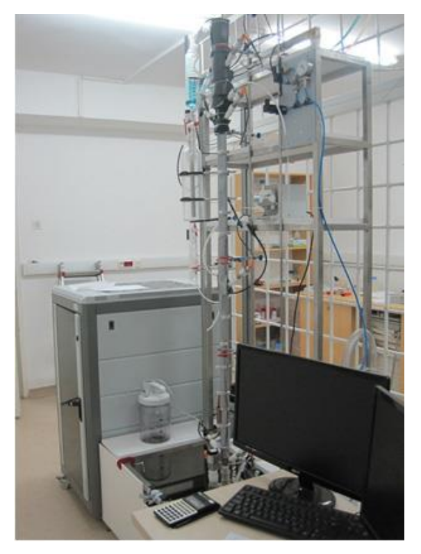
Figure 2. Filled Tray Type Column System.