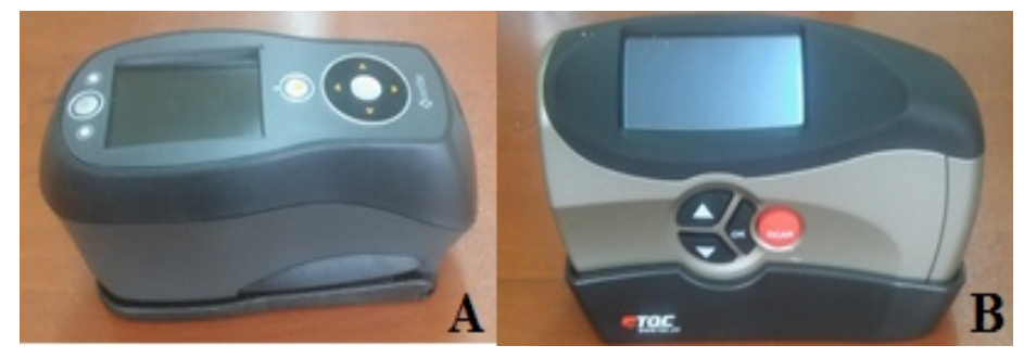
Figure 2. The colour measuring device (X-rite Ci62) (A) and the gloss meter (TQC PolyGloss GL0030) (B)