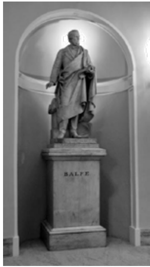
Fig. 1: A marble statue in the Drury Lane Theatre, London