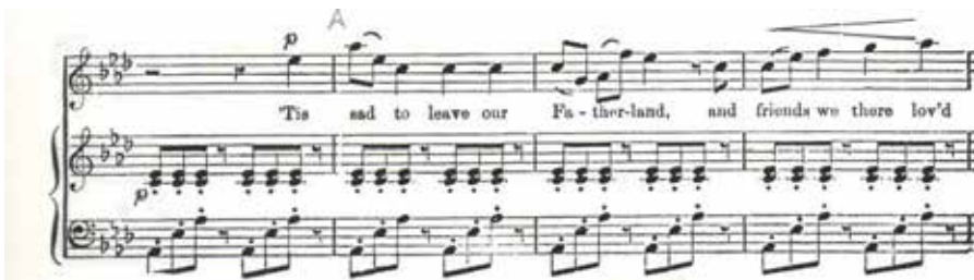
Fig. 3: Beginning of Thaddeus’ cavatina (Act I) 14

The orchestral accompaniment of this aria is quite simple, as it consists of basic chords. The gentle melody is in a bel canto style, intended for a light-lyric tenor voice, which fits perfectly to the character of a young man. Thaddeus’ parallel in Cervantes’ novel is a charming nobleman named Juan de Cárcamo. He meets Preciosa in Madrid and falls in love with her. He proposes to the young girl, and is challenged by her to spend two years living with the gypsy group. He accepts, but changes his name to that of Andrés Caballero.