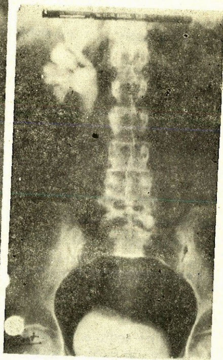
Figure 2. Early control IVP taken two months after the operation. Note mild improvement of right hydronephrosis.