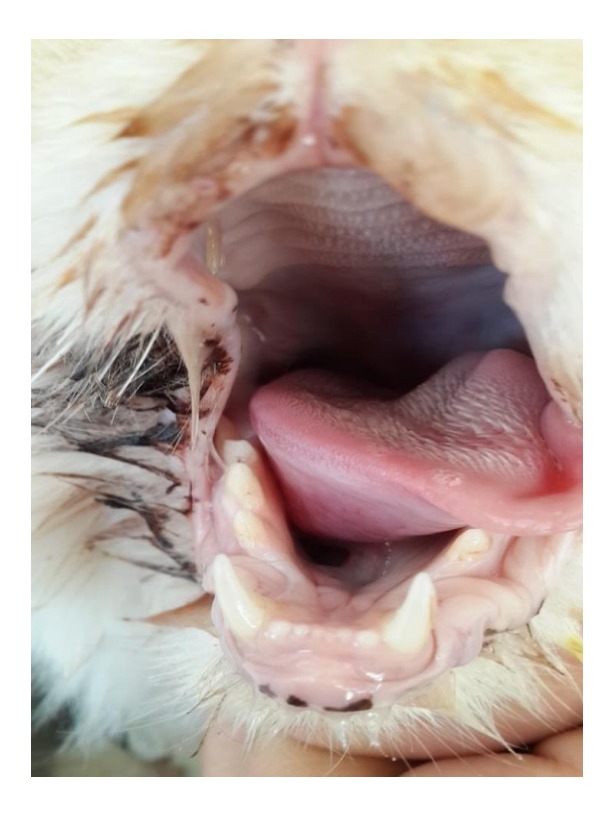
Figure 1 Tongue was positioned on the left side

Metronidazole (15 mg/kg, iv), amoxicillin-clavulanic acid (25 mg/kg, sc) and fluid treatment were administered to the patient, respectively. At general anesthesia, a biopsy was taken from the bulk at the root of the tongue with fine needle biopsy. The diagnosis of squamous cell carcinoma including epithelial cell layers in the pleomorphic structure in histopathologic sections; hyperchromatic, irregularly restricted, with large diameter, centrally located nuclei and eosinophilic cytoplasm was confirmed. After the biopsy, the patient died within approximately 2 weeks.