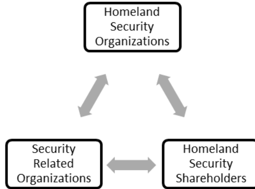
Figure 2. Multi-Dimensional Coordination of Homeland Security Sphere

National terrorism preparedness requires these numerous entities' preparation to operate in close coordination to meet various threats and to mitigate their consequences (Wise and Nader, 2002). As then USA president George W. Bush stated that the efforts to defend the country have to be comprehensive and united (Bush, 2002). Therefore, the coordination of both public and private efforts in every level of federal, state and local have to be managed deliberately.