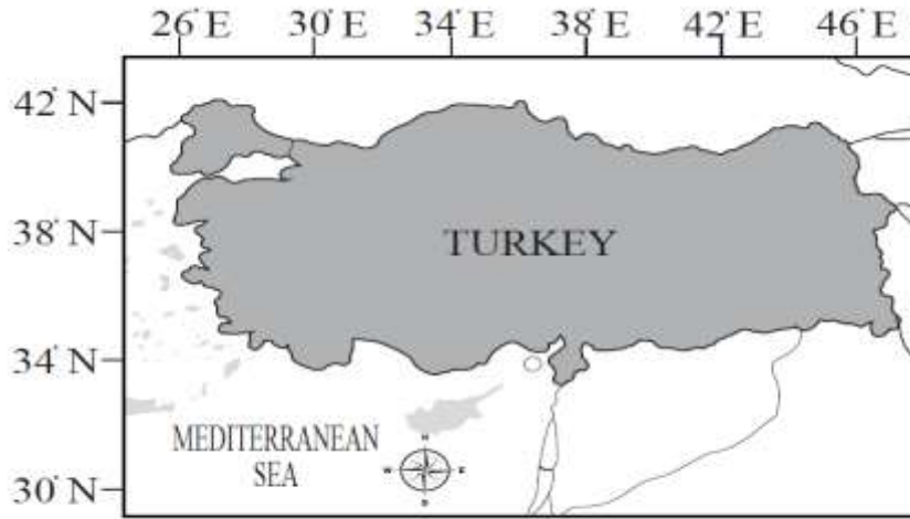
Figure 1. Sampling area (O), Northeastern Mediterranean sea

Trigloporus lastoviza individuals were captured by commercial bottom trawler at a depth of 155 to 212m off the Iskenderun Bay (36°13'650 N-035°23'032 E, 36°16'622 N-035°18'509 E) in 2015 fishing season (Figure 1). A total of 84 specimens (52 females and 32 males) were collected and transported to the laboratory on ice. Each fish was measured for total length to the nearest 0.1cm, weight (W) was weighted to the nearest 0.1g and the sex was determined by macroscopic observation of the gonads at the laboratory in Fırat University. In the length-weight equation "a" and "b" are intercept and the slope (=exponent) of the length-weight curve, respectively. Data were subjected to statistics analysis by using the IBM SPSS Statistics ver. 22.0 for Windows. Total lengths and weights were fitted to the length-weight equation: W=aL^b , by using least square methods with Statistical software [14]. The "b" value for this species was tested by a t-test at the 0.01 significance level to verify if it was significantly different from 3 [15].