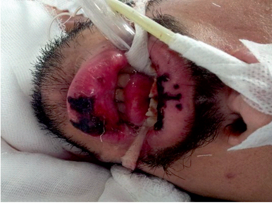
Figure 1) Ulcerations all throughout the mouth