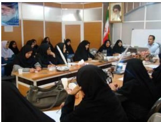
Figure 6. Entrepreneurship lecture for managers of rural women cooperatives in South Khorasan province (2010).

In Figure 6 that are available in Appendix, author presented entrepreneurship lecture for managers of rural women cooperatives in South Khorasan province (2010).