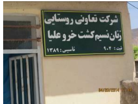
Figure 1. Rural women cooperative of Kharve Olia village on Tabas city, 335 km distance from Birjand, center of South Khorasan province.