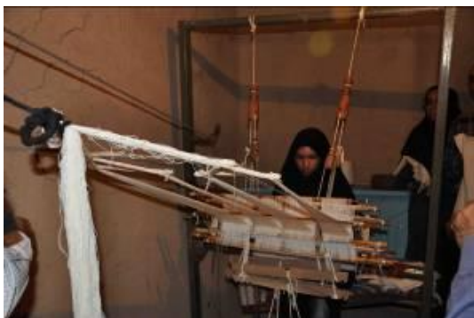
Figure 7. Various empowering activities of rural women cooperatives in Birjand, centre of South Khorasan province (2010-2015).

women cooperatives in Birjand, centre of South Khorasan province (2010-2015).