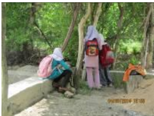
Figure 2. Girls and boys that came back from their primary school that established in recent years.