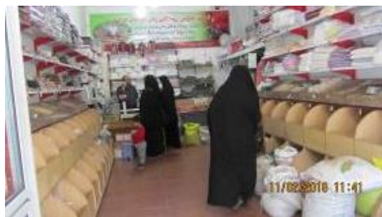
Figure 3. A department store of rural women cooperative of Khorashad village (Distance from Birjand: 30 km) in Birjand, centre of South Khorasan province.

In Figure 3 that are available in Appendix, author presented a department store of rural women cooperative of Khorashad village (30 km distance from Birjand, centre of South Khorasan province) on Birjand city, that providing necessary requirements with moderated and reasonable prices and marketing products of their members in fields of nutrition, horticulture, medical plants, handicrafts, carpet weaving, etc.