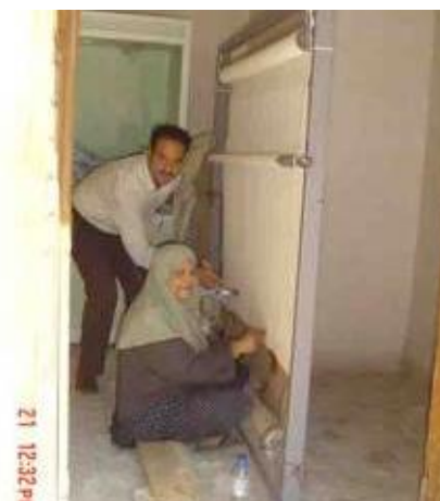
Figure 5. A handicrafts cooperative in Yazd province in center of Iran (2008).

In Figure 5 that are available in Appendix, author presented a handicrafts cooperative in Yazd province in center of Iran.