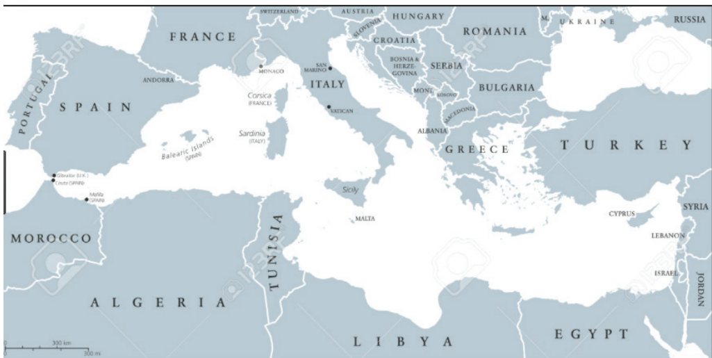
Figure 1: Mediterranean Countries.

As a sea, space, and region with porous borders, the Mediterranean faces several challenges that urge all countries with Mediterranean coastlines to consider cooperation seriously. The Mediterranean is co-possessed by more than 20 countries in three different continents: Europe, Africa and Asia. As shown in Figure 1, the number of countries in the European continent with Mediterranean coastlines exceeds those in Africa and Asia. Spain, France, Monaco, Italy, Malta, Slovenia, Croatia, Bosnia and Herzegovina, Montenegro, Albania, Greece, Cyprus, and Turkey are the European countries of Mediterranean. In addition, though it does not have a coastline on the Mediterranean, Portugal is also considered part of the region. To the south, Algeria, Egypt, Libya, Morocco, and Tunisia are the African countries with Mediterranean coastlines, while in Asia, Israel, Lebanon, and Syria share the Mediterranean.